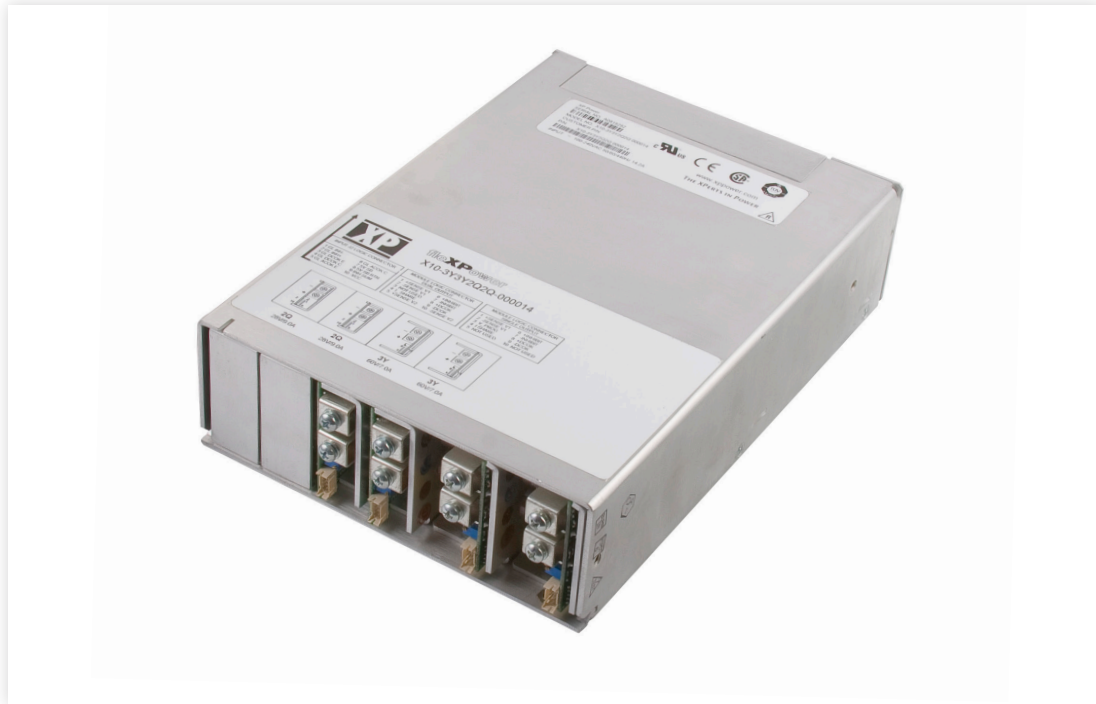
Figure 4: Medically approved fleXPower series offers from 400 Watts to 2500 Watts with up to 20 outputs

For higher power applications there are readily available configurable solutions providing high power multiple output power solutions with medical safety agency approvals as standard, such as the fleXPower series pictured below.