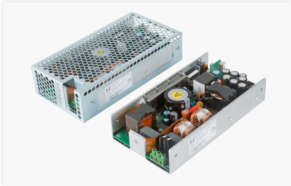
Figure 4: Medically approved fleXPower series offers from 400 Watts to 2500 Watts with up to 20 outputs