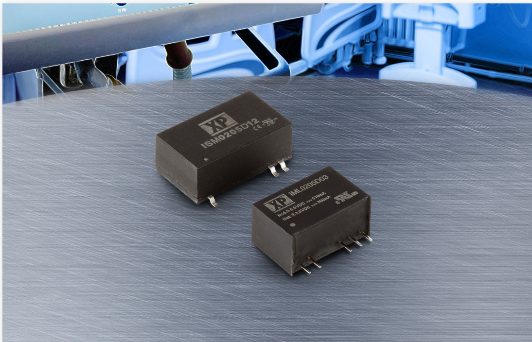
Figure 3: XP Power’s medically approved DC-DC converters from 1 Watt to 20 Watts.

Wide range input DC/DC products, offering a tightly controlled output over a wide DC input and output load range, with up to 2 x MOPP isolation and equally low internal capacitance are also readily available for DC input or battery powered portable devices.